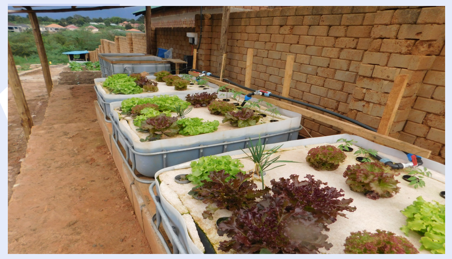
Plastic Aquaponics Unit with Vegetable production at Kyanja ARC