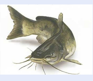
African Cat fish

facilities and water filtration for re-use in fish growing. The plants use nutrients from fish effluents thereby purifying the water to benefit the fish with zero waste to the environment and there is no need of exogenic fertilizers.