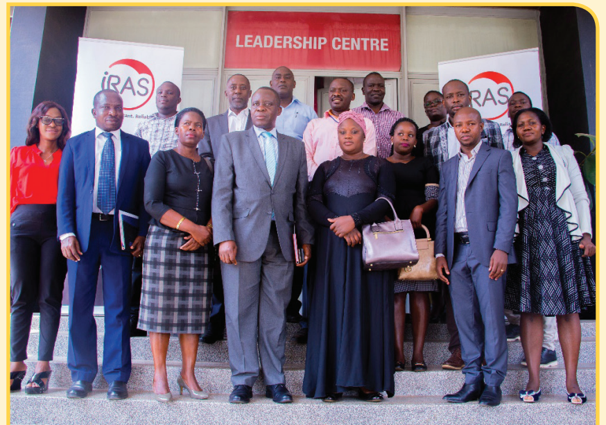
Strengthening urban capacities in municipal financing to promote good urban governance and service delivery: Inception meeting of the EU supported Program on Integrated Finances for Sustainable Urban Development in GKMA

The overarching objective of the CoM SSA initiative and pilot projects is to empower local authorities to respond to the challenges climate change has presented for sustainable urban development through promotion of climate smart solutions. Under the first phases (2015 – 2020), the EU support has seen Kampala pilot an urban air quality monitoring system and detailed neighbourhood planning in the precincts of Kololo, Makerere, Mulago and Nakasero. KCCA has also been able to scale up the management of its urban natural assets, promote skilling in green enterprise development, build capacities in climate reporting and strengthen the framework for decentralized cooperation among Ugandan (Entebbe and Kasese municipalities) and European (Strasbourg and Karlsruhe) urban authorities.