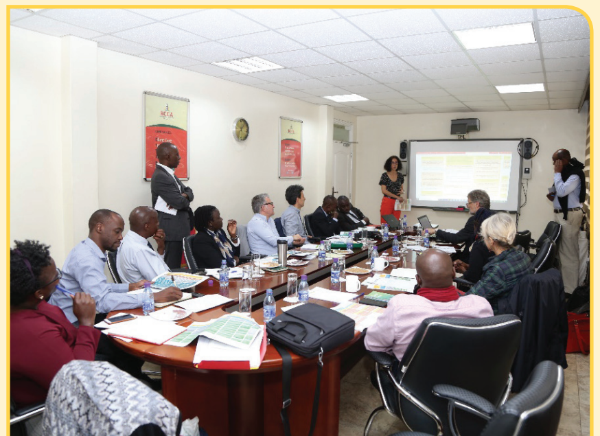
Decentralized cooperation with EU counterparts facilitating technical assistance and knowledge transfer between local authorities. Teams from KCCA and Strasbourg designing joint projects to address different sustainable development challenges.

The next phase (2020 - 2022) will focus not only on consolidating the above achievements, but also replicating the paradigm of local level climate action planning to other municipalities and promoting the transition to clean energy solutions.