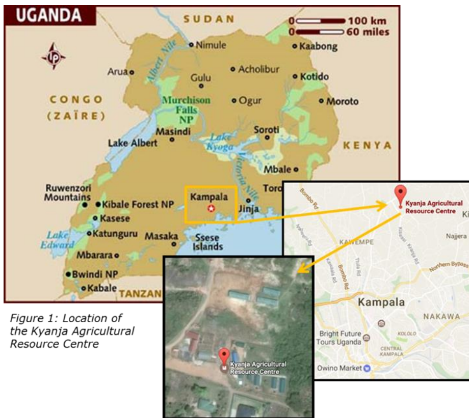
Figure 1: Location of the Kyanja Agricultural Resource Centre